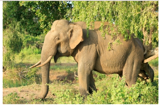
Asian Elephant, Yala National Park