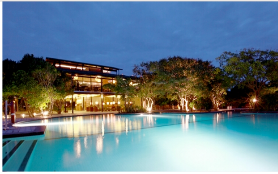
Cinnamon Wild, Yala