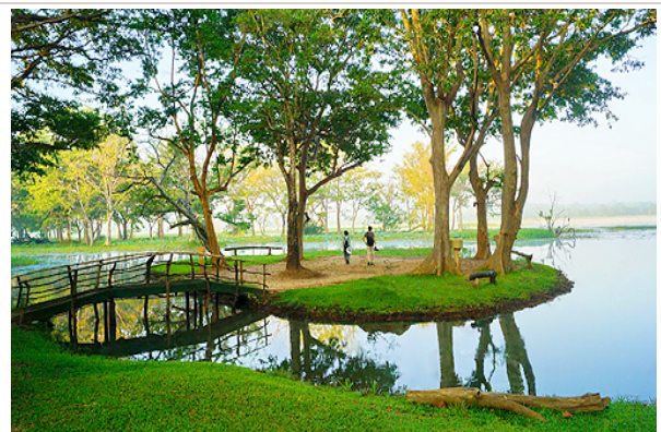
Cinnamon Lodge, Habarana

In the morning, visit Polonnaruwa (1 ½ hour drive). The ancient heart of Sri Lanka and a UNESCO World Heritage Site, Polonnaruwa, is still well-preserved with 12th century ruins & impressive stone culture that recalls an inspired past. Surprisingly, Polonnaruwa is widely regarded to be among the top locations in the country for watching primates. All three species of monkey- the toque Macaque and the canopy dwelling Purple-faced Leaf Monkey (both endemics) and the Grey Langur can be observed here. Polonnaruwa’s ‘Temple Troop of Toque Macaques’ have been featured in numerous natural history documentaries are a part of the world’s longest running study on primates which has run continuously since 1968. The monkeys here are habituated to the presence of humans enabling excellent opportunities to observe their social interactions at close-range. Whether play fighting, feeding or grooming each other there is never a dull moment when watching the antics of the Langurs and Macaques.