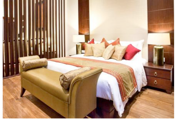
Uga Residence, Colombo