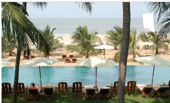
Jetwing Beach, Negombo

Spend 01 night at Jetwing Beach in Negombo. Accommodation is in a Deluxe Room. Your stay is on bed and breakfast basis.