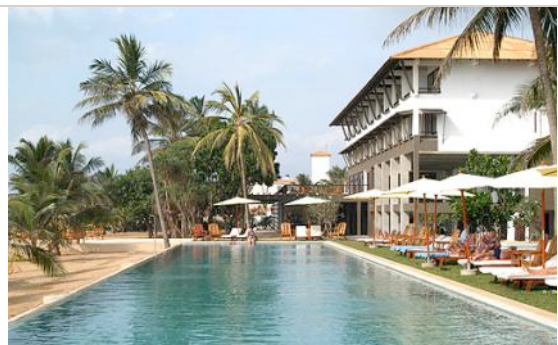
Jetwing Beach, Negombo