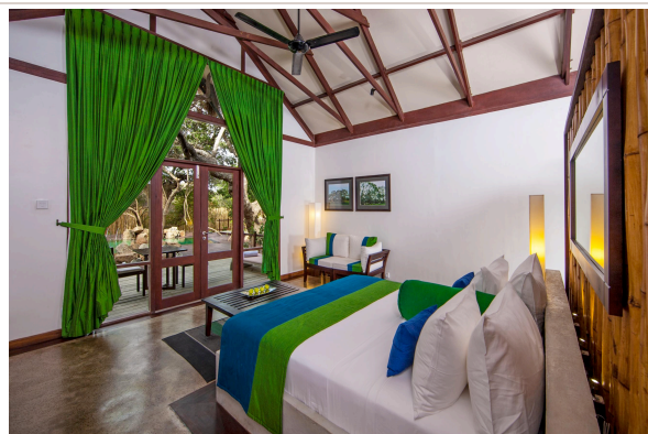
Jungle Beach, Trincomalee