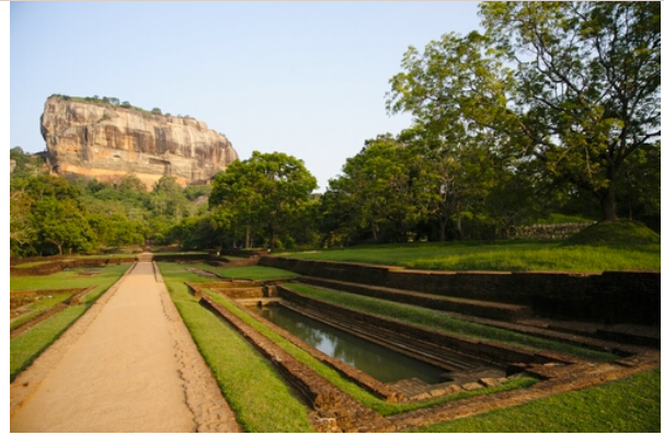
SIGIRIYA ROCK FORTRESS