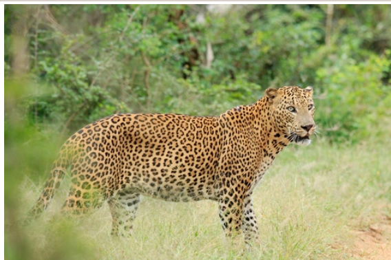
Leopard, Yala National Park

Overnight at Cinnamon Wild, Yala. Accommodation is in a Jungle Chalet. Your stay is on a Half Board basis.