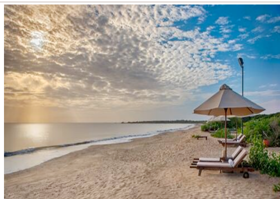
Jungle Beach, Trincomalee