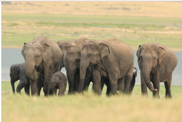
Elephants at Minneriya National Park

Spend 02 nights at Cinnamon Lodge, Habarana. Accommodation is in a Deluxe Room. Your stay is on a Half Board basis.