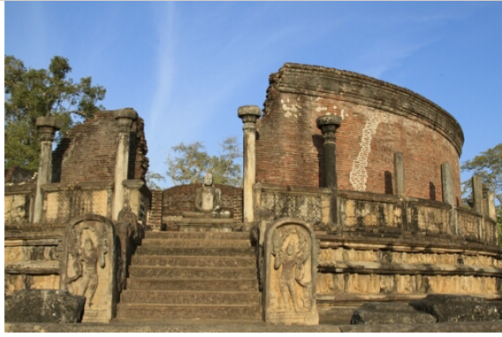
Vatadage in Polonnaruwa