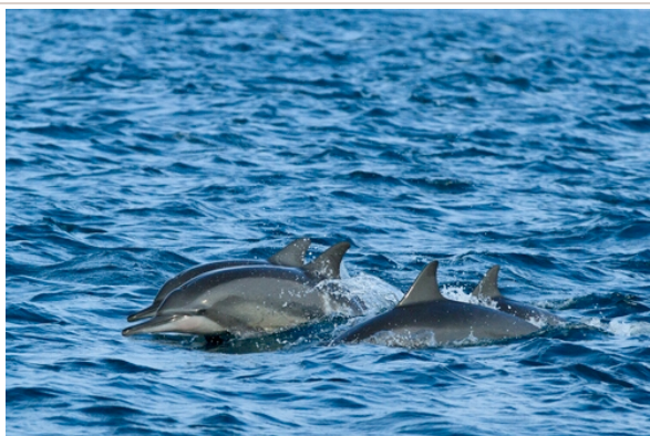
Spinner Dolphins on the move

Overnight at Jetwing Vil Uyana. Accommodation is in a Paddy / Marsh Dwelling. Your stay is on a Bed & Breakfast basis.