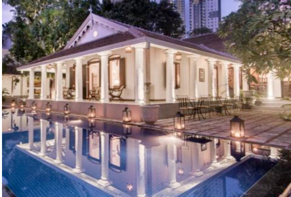
Uga Residence, Colombo

Spend 01 night at the Uga Residence, Colombo. Accommodation is in a Park Suite. Your stay is on a Bed & Breakfast basis.