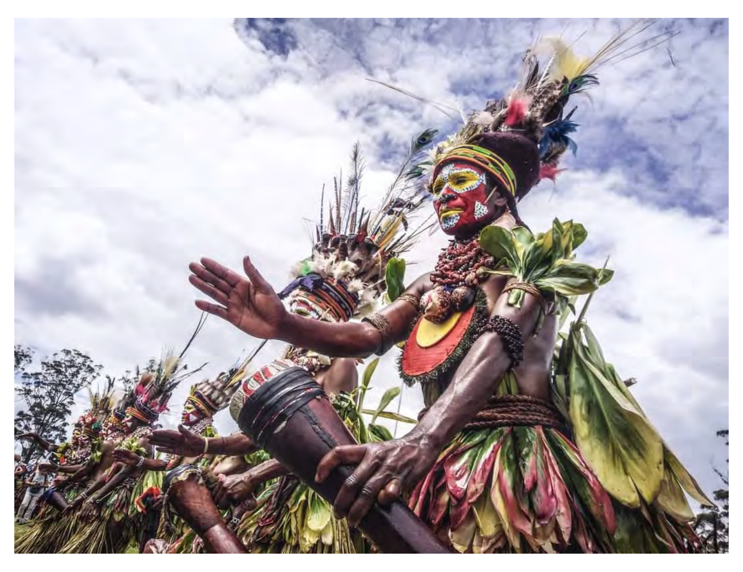
Mt Hagen Women – At the Sipuu-Waa ( Simbu) Cultural Festival 2022 – July