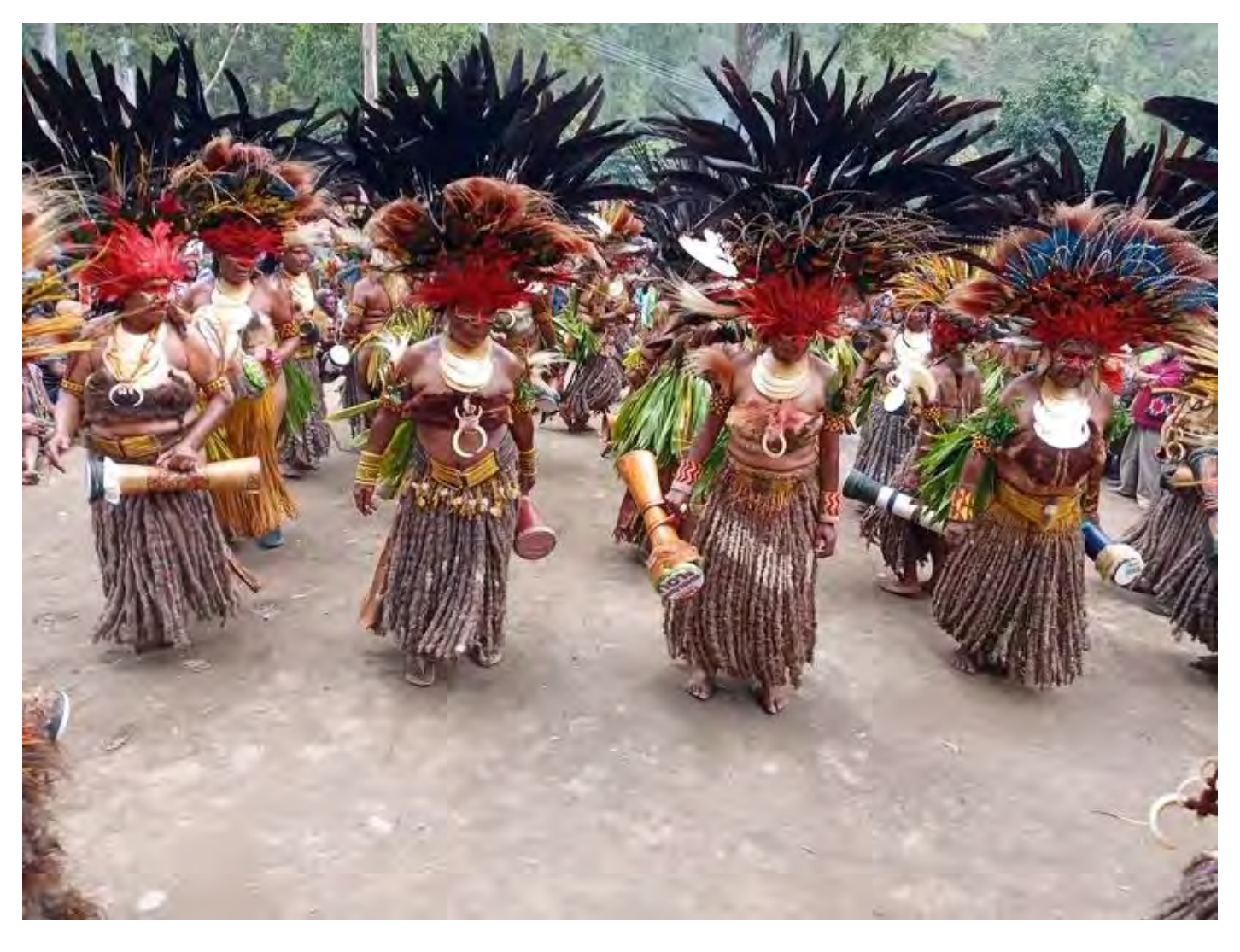
Singsing Groups Dance and Welcome the Crowds and Visitors and happy for the Ceremony to Began