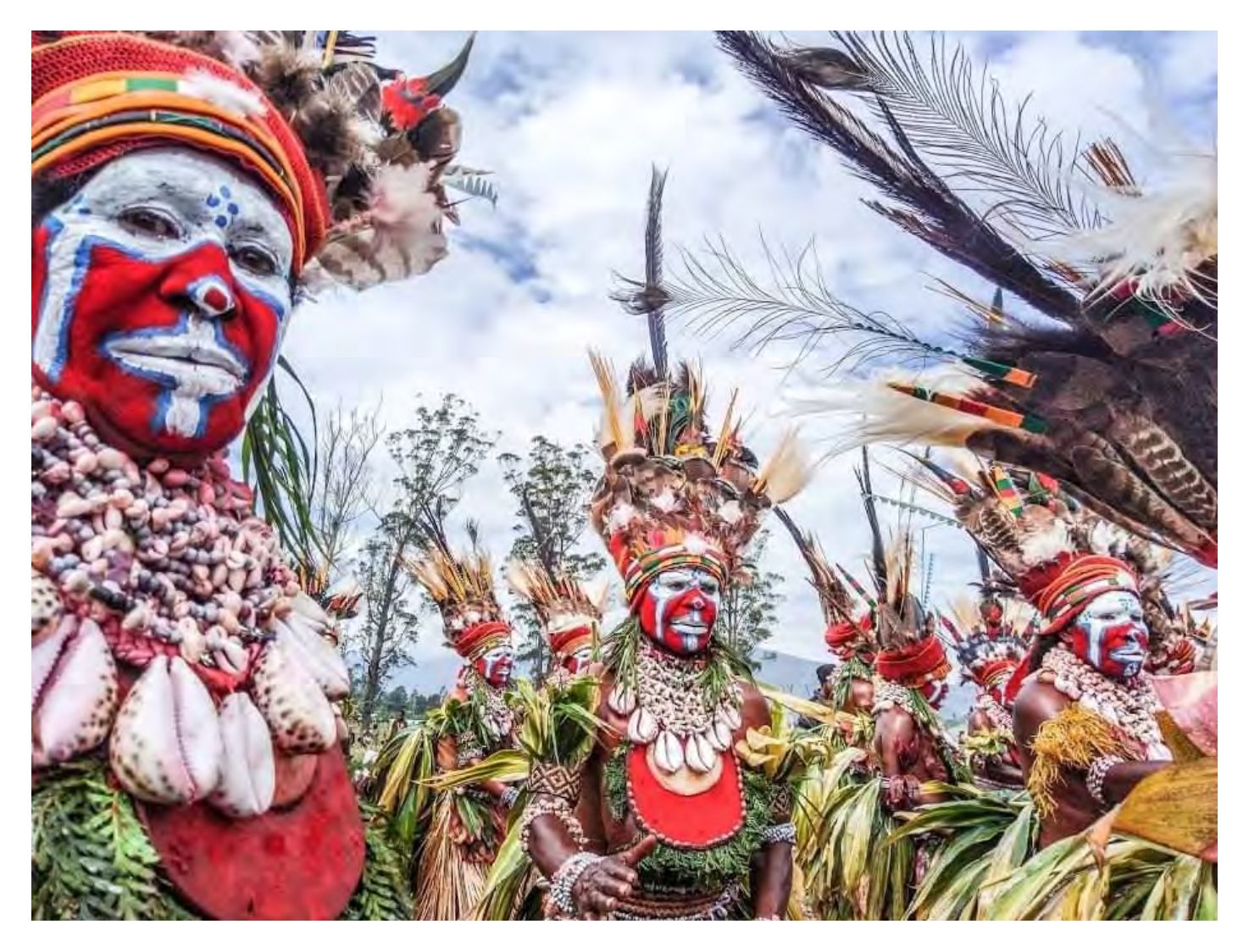
Mt Hagen Women at the Sipuu-waa (Slmbu) Cultural Festival - 2020