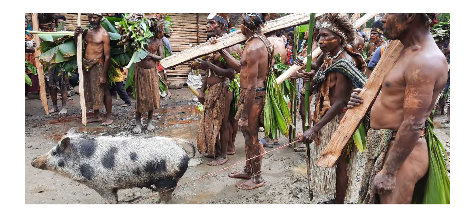
Hosting Tribes starting to Bring in their prestiges to demosnatrte to the other tribes that we are fit to participate in this Pig KILLING Ceremony, they are going into the Ceremonail Grounds