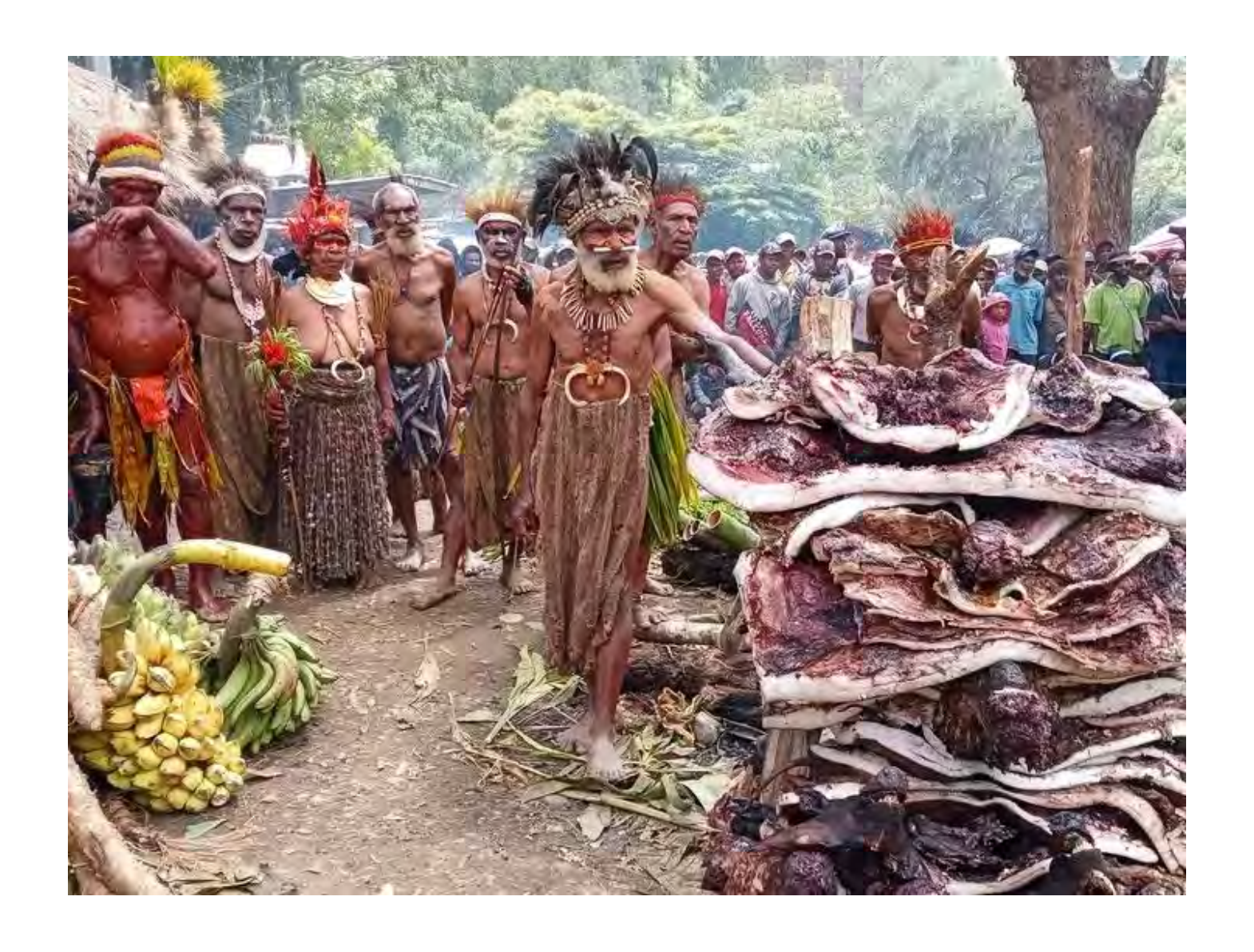
All Cooked Pork and raw food ready for Ceceremonial Exchanges with Tribes in the Gembogl District, Simbu, PNG