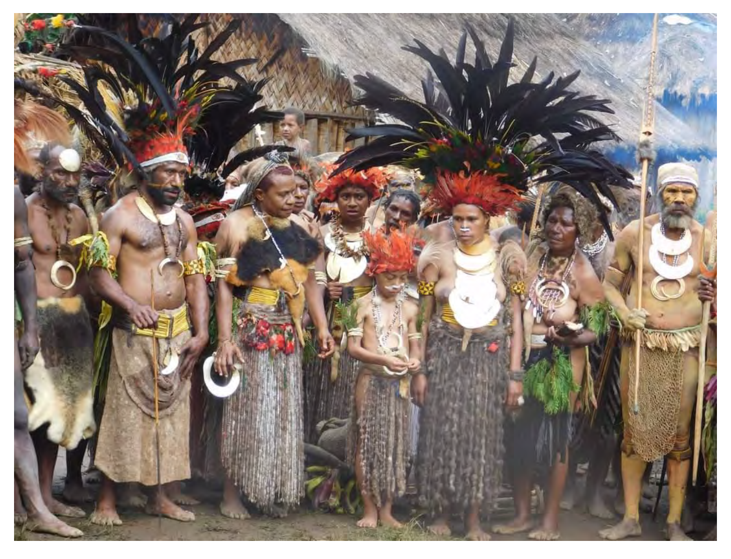
Bingla Ingu Festival includes Birde and Groom Exchange at the end part of the Ceremony