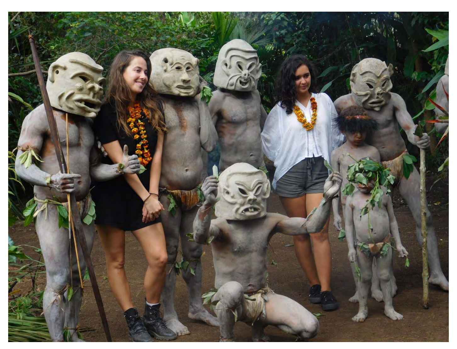
Our Goroka Tour in 2019 – Asaro Mudman by Americal Girls Visiting

Your will also get to witness the traditional method of cooking in the earth before point the villages for lunch . After lunch, You will have the Mt Gurupoka Hikking and MOKA MOKA Dance Overnight: Pacific Gardens Hotel Premier Wing (BLD)