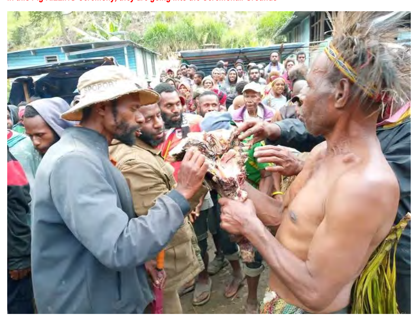
As soon as the Ceremonial Excahnge is done, PORK BELLY is for the spectators to have share and to demonstrate that the Tribes Friendship will be on going for the next generations in the Inaugl Tribes