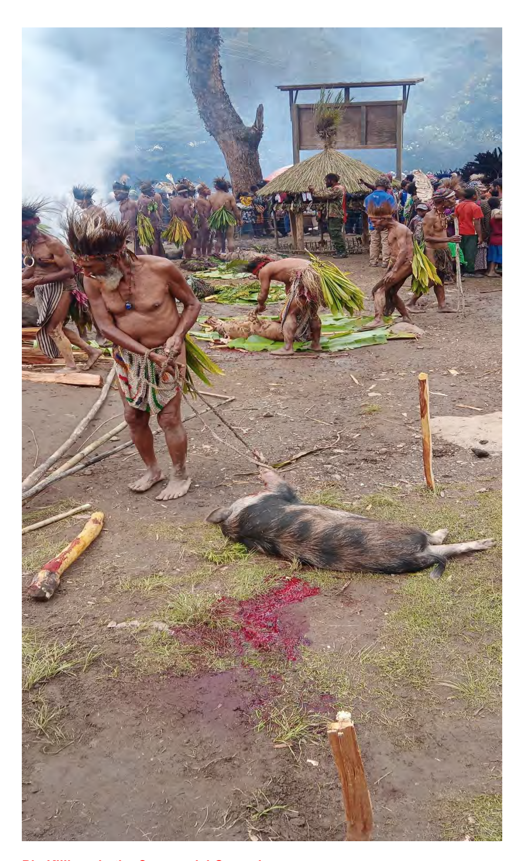
Pig Killings in the Ceremonial Grounds