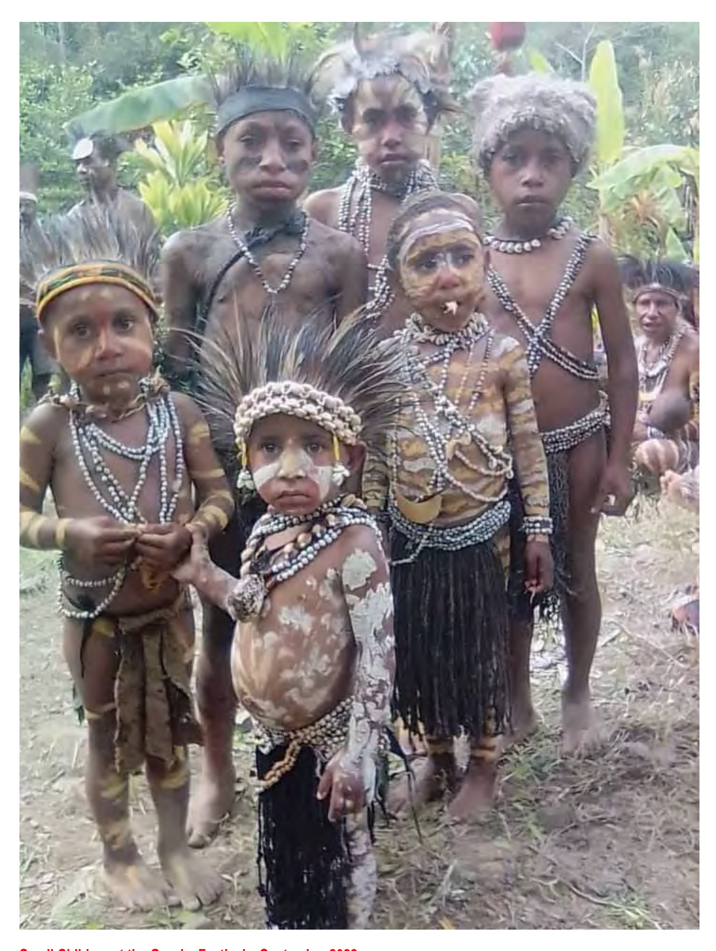
Small Children at the Goroka Festival – September 2022