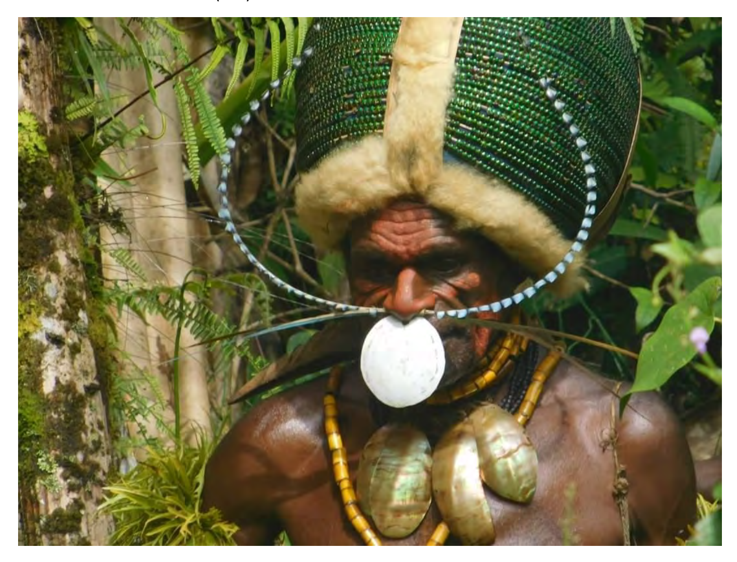
Kalam Tribes – The Beetle Heads... (Early Bird Tours during Goroka Festival in 2019)

Be overwhelmed as you meet and learn about the many diverse tribes which still populate the highlands. Traditional clothing, dance and song will all be on show. It really is a sight to behold. The show contines today for the second day, there will be more than 5-70 groups of Singsing comepeting with each other in the show ground with Judges judging toady for the winner group. You experience will be overwhelming that will be a mind blow away. The show contine today and finishes. Green Land Motel (BLD)