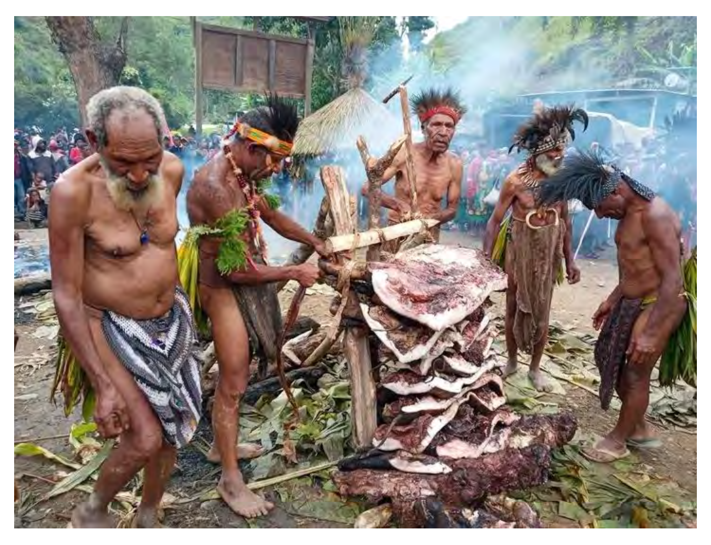
Cooked pork Displayed for the Ceremonial Exchnage to take place, it is removed straight from the Ground Oven ( MUMU PIT)