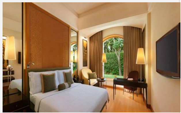
Trident Hotel, Gurgaon