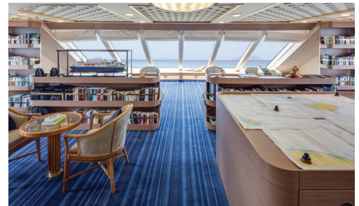
Top: Category 6 French balcony suite. Middle: Category 3 cabin. Bottom: Observation lounge and library.