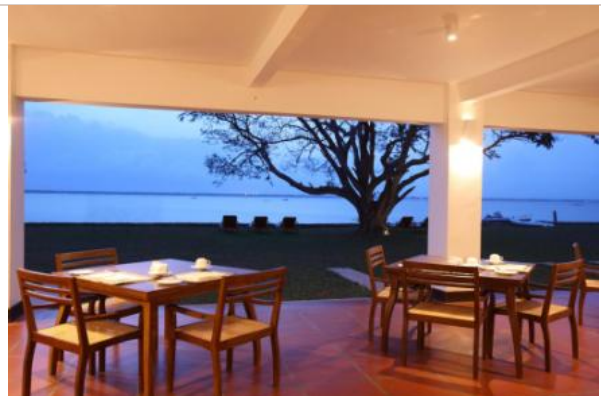
Jetwing Lagoon, Negombo