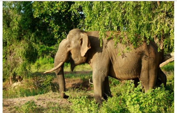
Asian Elephant, Yala National Park