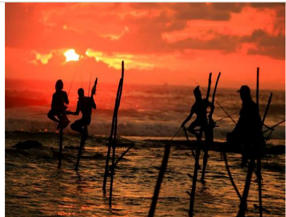
Stilt Fishermen at Ahangama