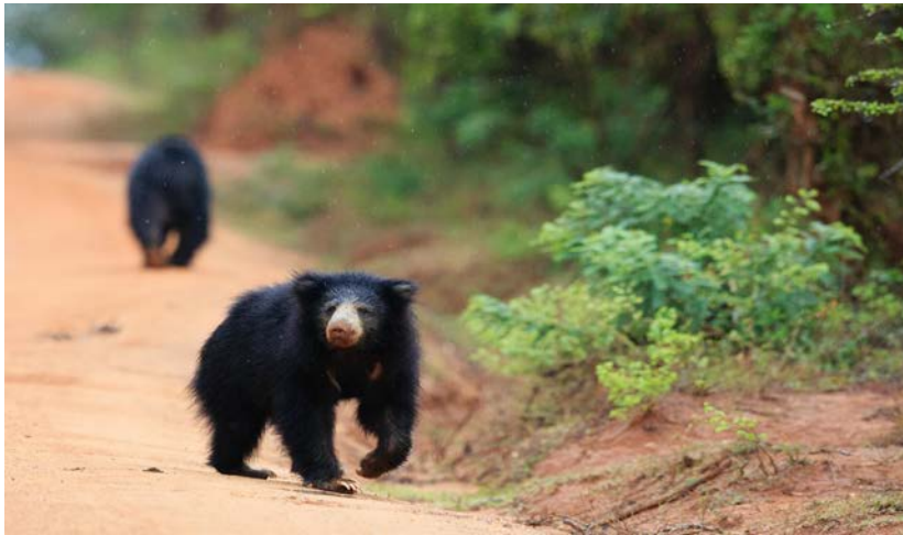
Sloth Bear, Yala National Park