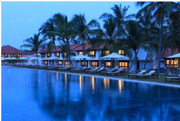
Jetwing Lagoon, Negombo

Spend 01 night at Jetwing Lagoon, Negombo. Accommodation is in a Bawa Room with en-suite facilities. Your stay is on a half board basis.