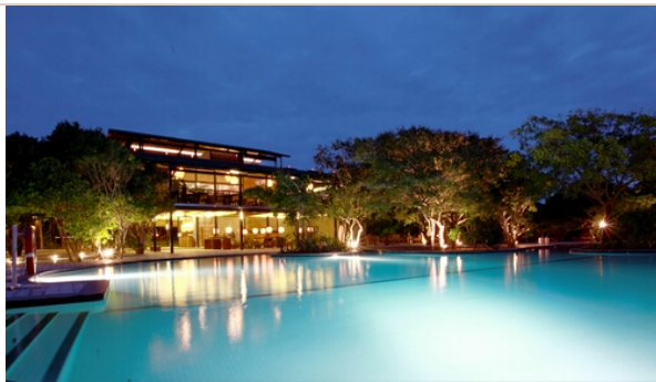
Cinnamon Wild, Yala

Spend 03 nights at Cinnamon Wild in Yala. Accommodation is in a Jungle Chalet and your stay is on a half board basis.