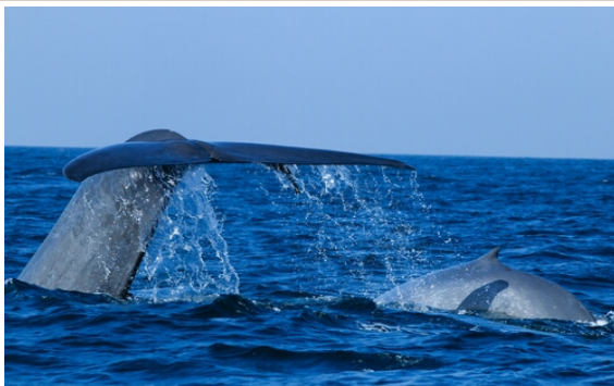
Blue Whale mother and calf off Mirissa

Overnight at the Mosvold Villa, Ahangama. Accommodation is in a Deluxe Room. Your stay is on a Half Board basis.