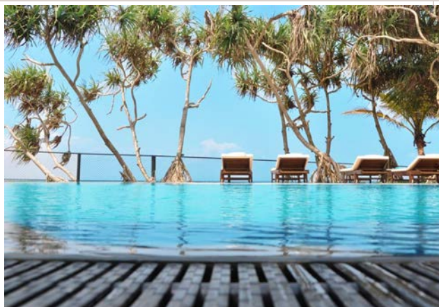
Mosvold Villa, Ahangama

Spend 06 nights at Mosvold Villa, Ahangama. Accommodation is in a Deluxe Room. Your stay is on a Half Board basis.