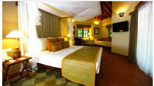
Cinnamon Wild, Yala