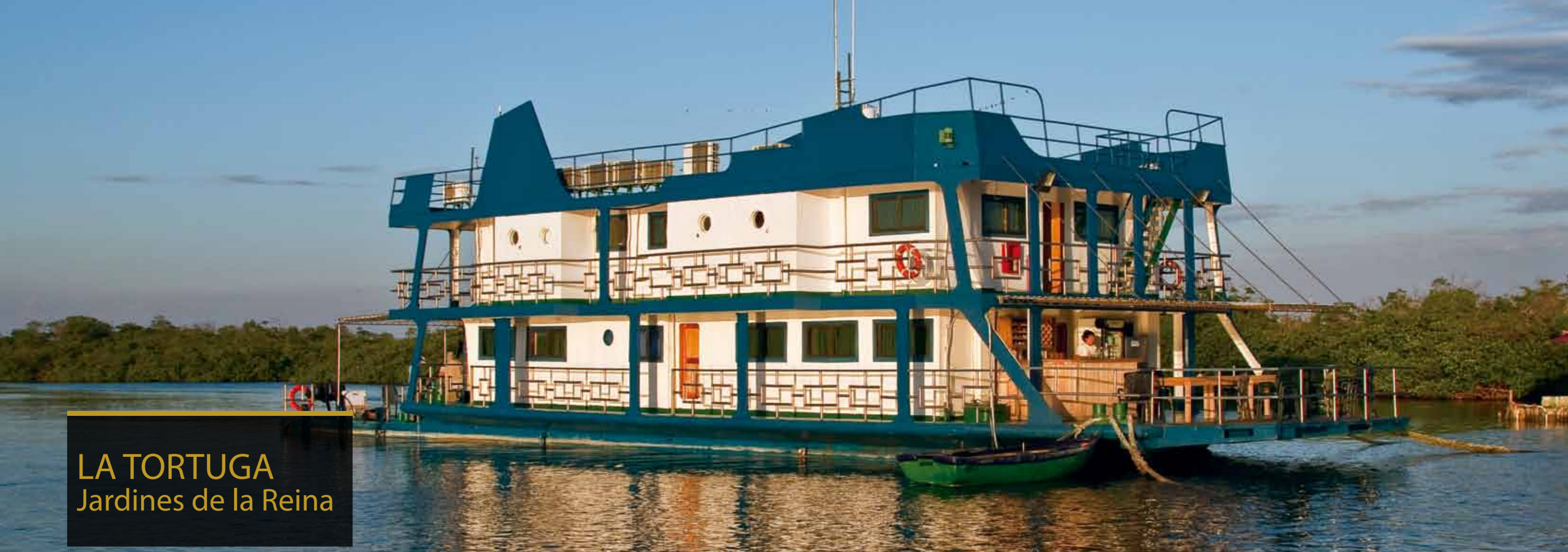
LA TORTUGA Jardines de la Reina