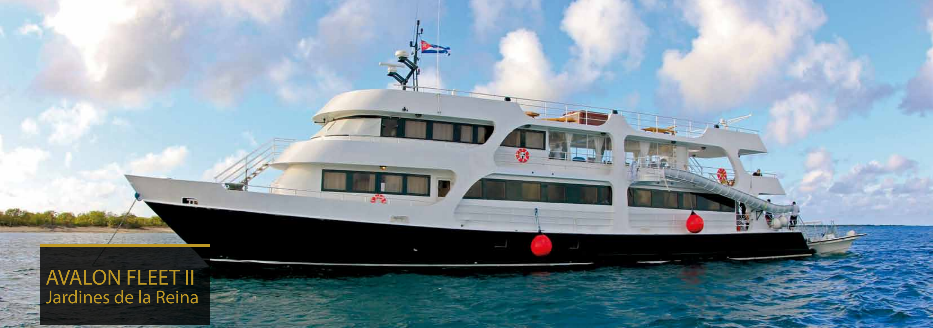
AVALON FLEET II Jardines de la Reina